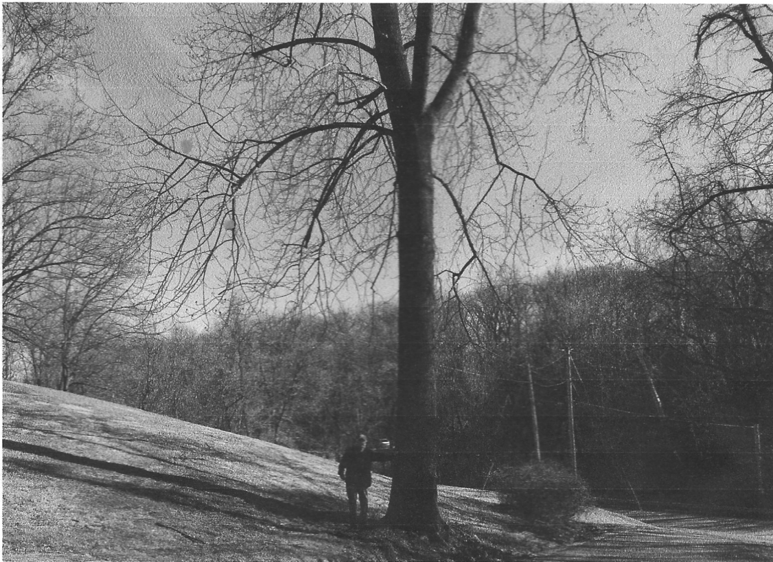
Here are the directions to McCully and a pic of the poplar we will be using.